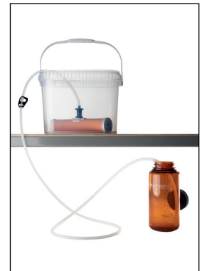
Buckets not included.